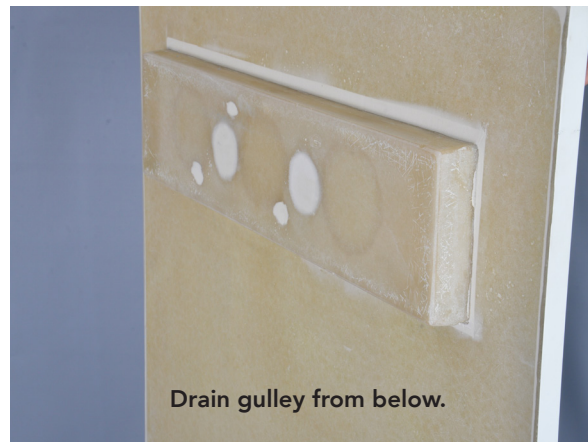
Linear shower foundation showing four gradients and three outlet locations in drain gully.