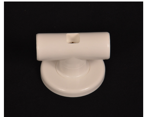
180° elbow bracket (5)