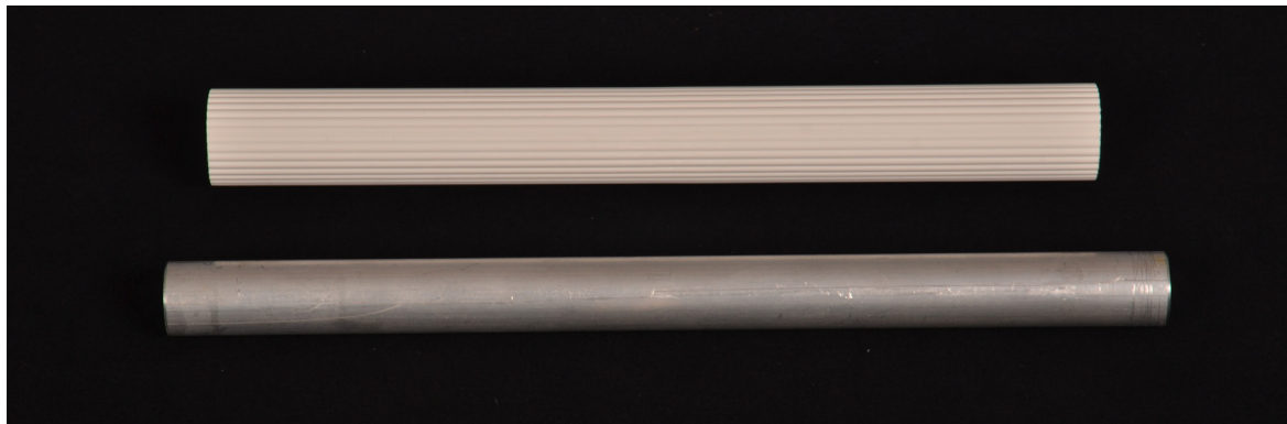
Grip cover and tube