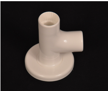
Corner elbow bracket (1)