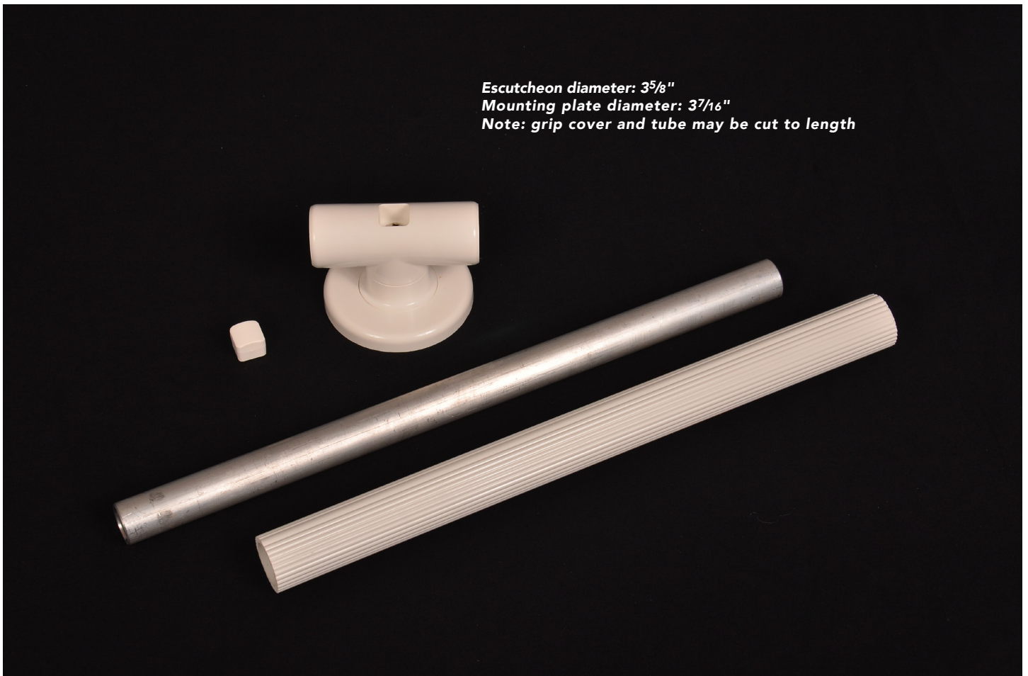
Extension Bar Kit