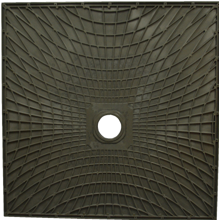
Underside of foundation showing arched structural ribbing and drain hole reinforcement ring.