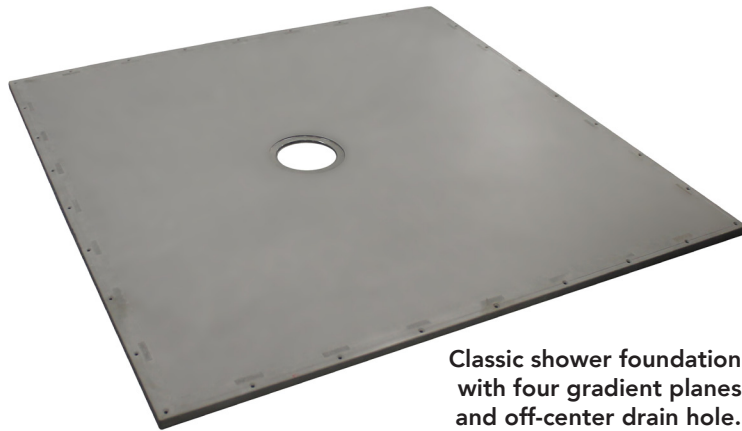
Classic shower foundation with four gradient planes and off-center drain hole.