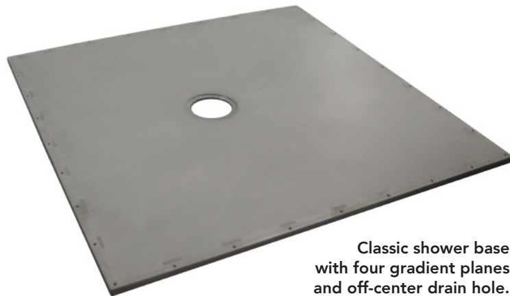
Classic shower base with four gradient planes and off-center drain hole.