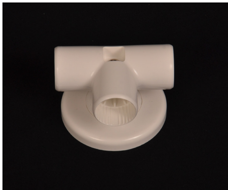
'T' elbow bracket (1)