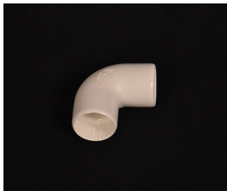
90° elbow fitting (1)