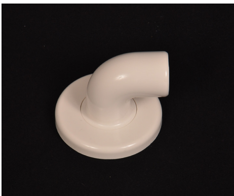
90° elbow bracket (3)