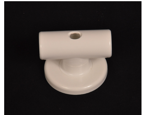
180° through elbow bracket (1)