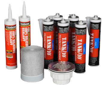
Color and surface texture detail.