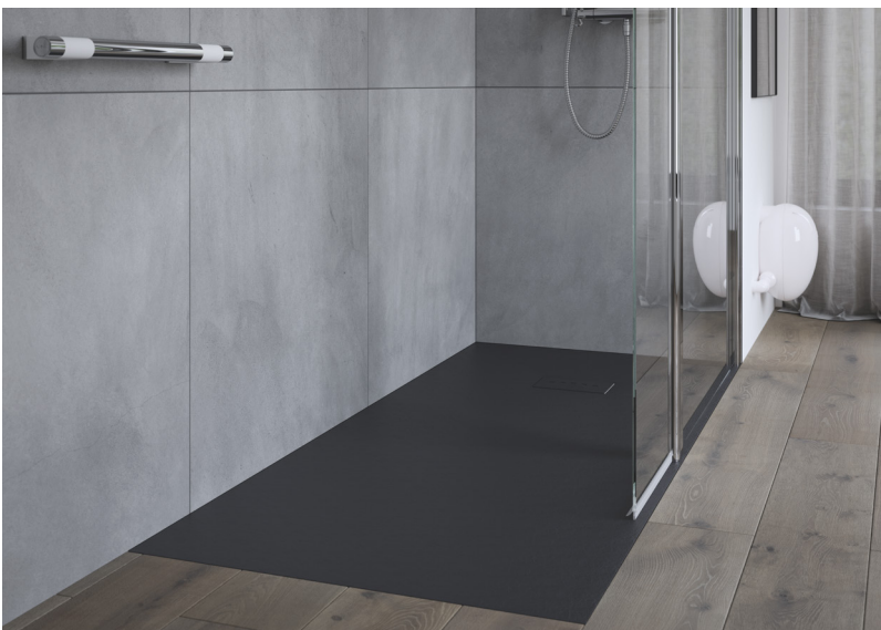
FastDEK installed on finished floor.