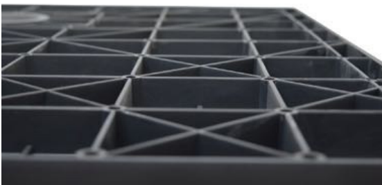
Ribbed underside detail.

Be sure to order a FastDEK installation kit: FB1000-IK.