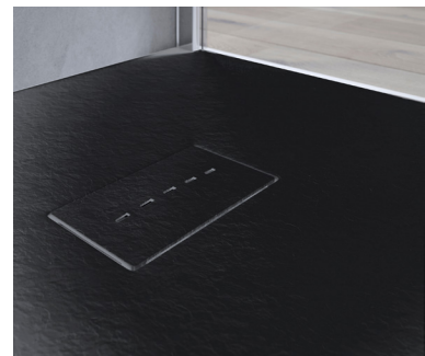
Drain cover detail.