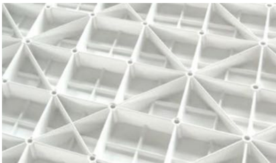
Ribbed underside detail.

Be sure to order a FastDEK installation kit: FB1000-IK.