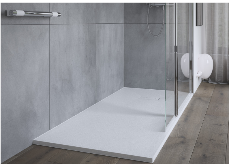
FastDEK installed on finished floor.