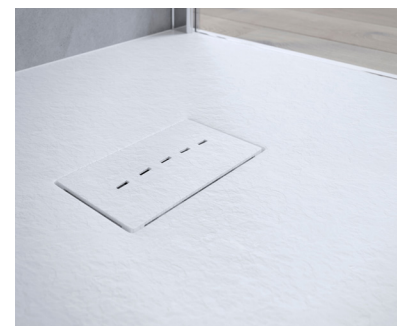
Drain cover detail.