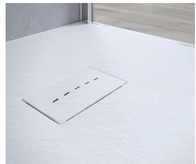
Drain cover detail.