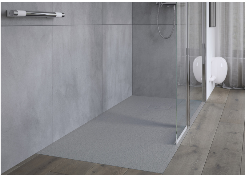
FastDEK installed on finished floor.