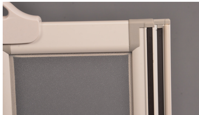
The "free edge" of each door pair has two magnetic strips that seal the overlap connection when the door is closed.