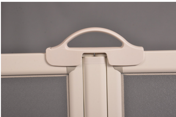
A hinged handle spans each hinge joint to hold the caregiver door straight while in the closed position.