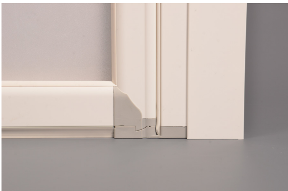
A riser mechanism raises each door pair slightly off the floor as it swings open, either inward or outward.